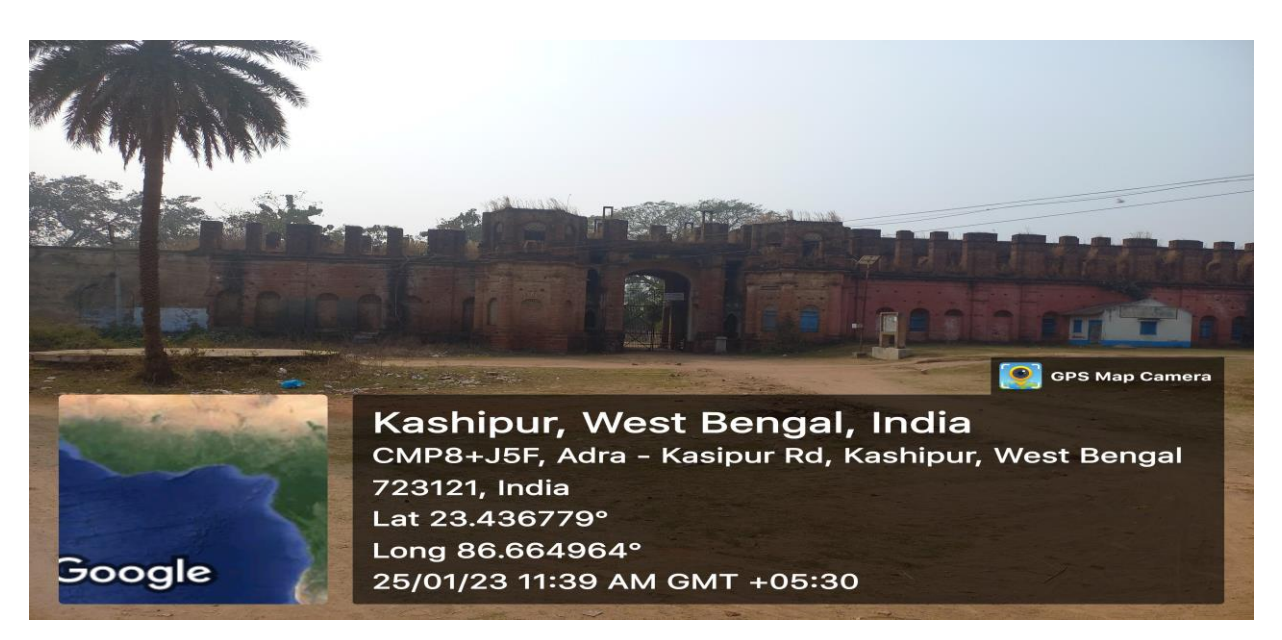
(The Palace of the Panchakote Dynasty where the Poet worked as Legal Advisor)