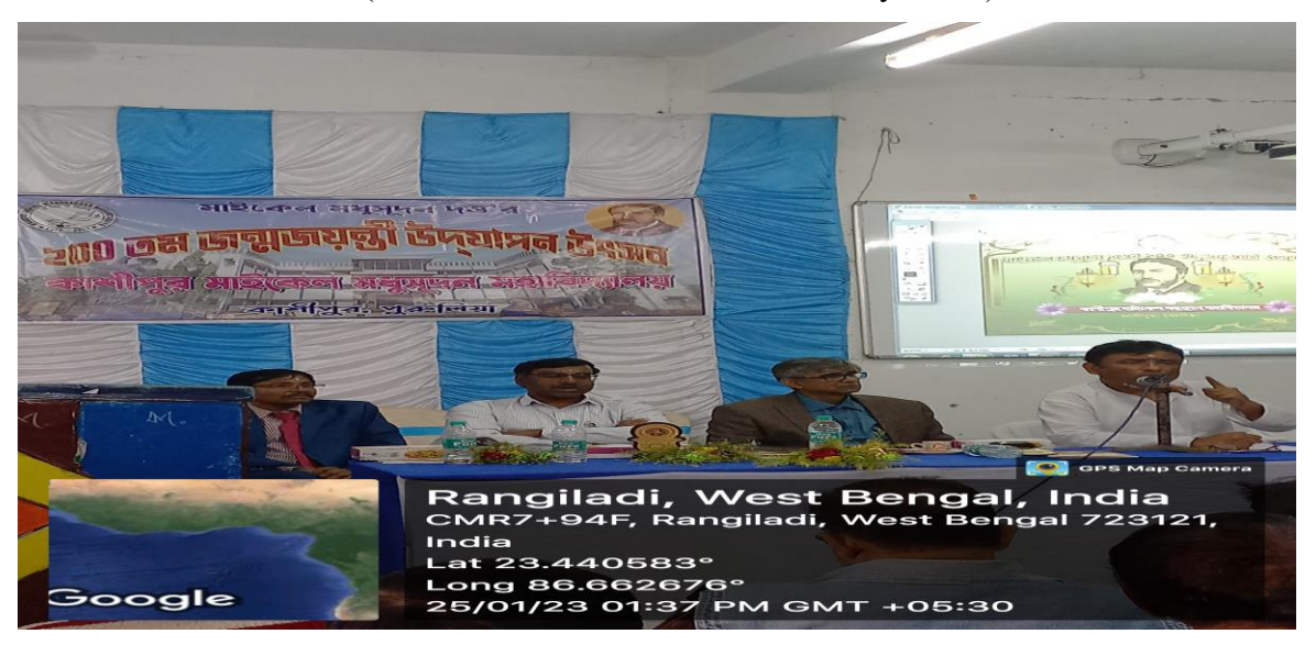
(Michael's 200<sup>th</sup> Birth Day Observation)