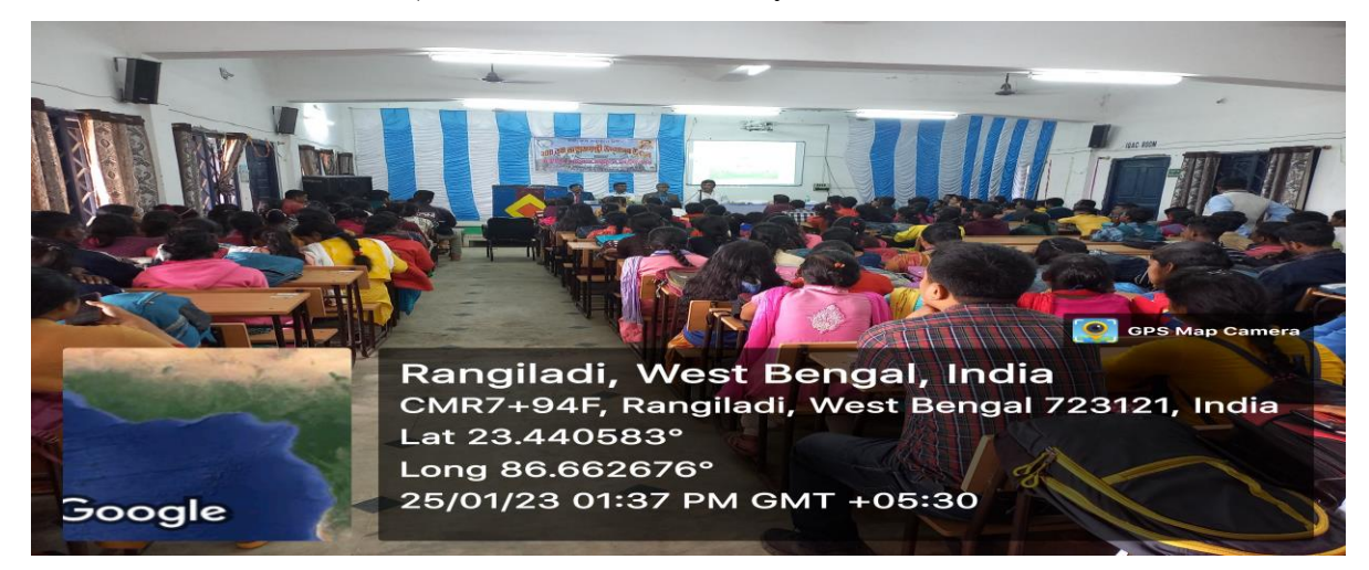
(Students' Participation at the Program)