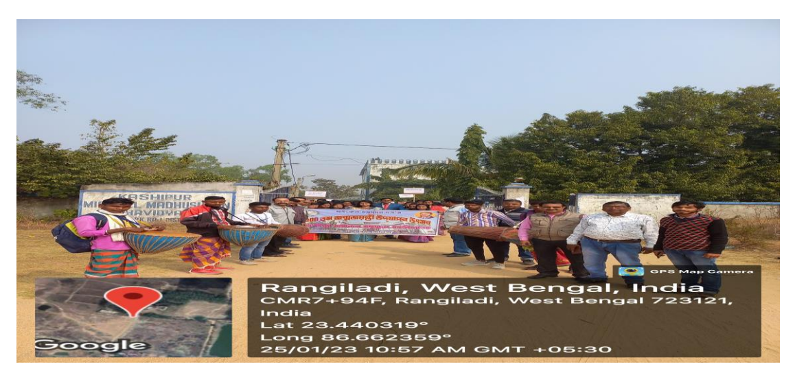
(Students' Rally for the Observance of the Great Poet's Birthday)