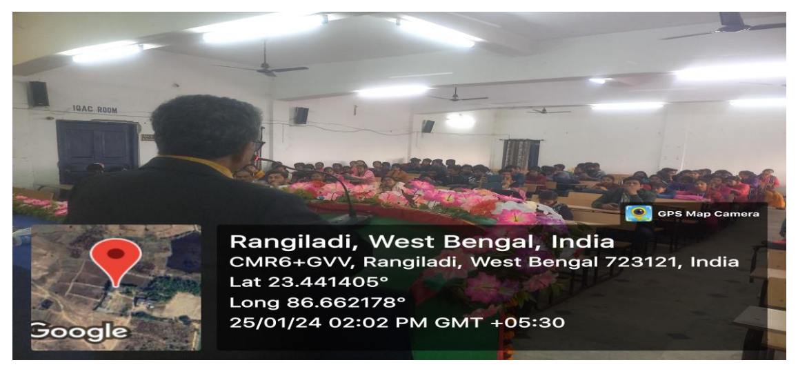
(Michael's 201<sup>st</sup> Birth Day Observation)